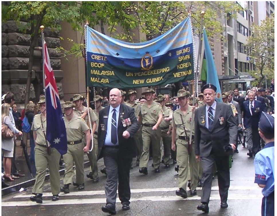
The President and Vice President lead the Association marching through the streets of Sydney on ANZAC Day, 2008

It was very satisfying to see the mix of attendees. There were the members from the WW2 17th Line of Communication Signals Association, Korea, Malaya and Vietnam veterans,