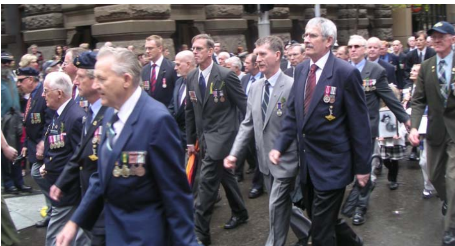
A few of the many members of the Association, who marched in Sydney on ANZAC Day.