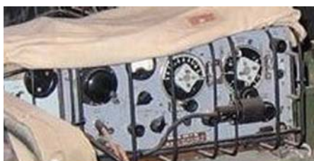
The Wireless Set in the Jeep in the Duxford Museum

Sorry to say but the bottom picture is a 'WS-19' OK but the one in the jeep is a 'WS-22'