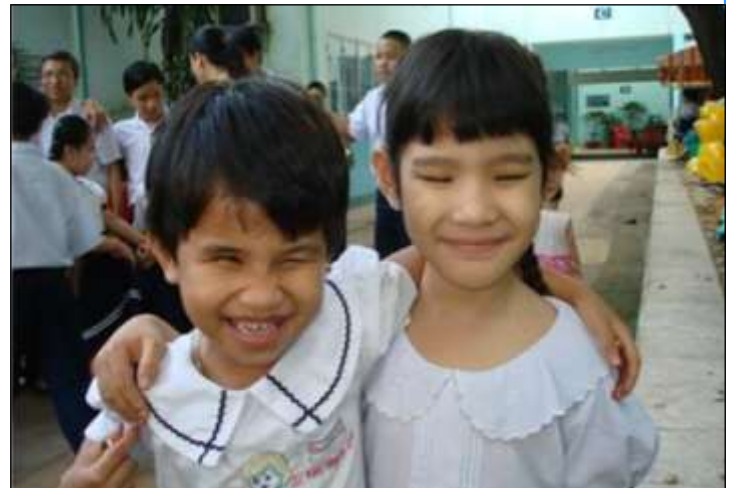
Children of 'Loreto'