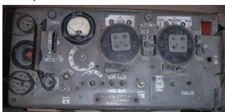
Wireless Set WS-19 as seen in the Military Relics Museum, Han Oi