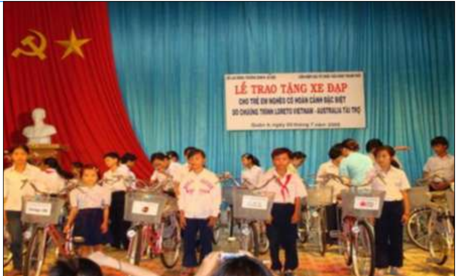
Loreto Children Receiving Bikes