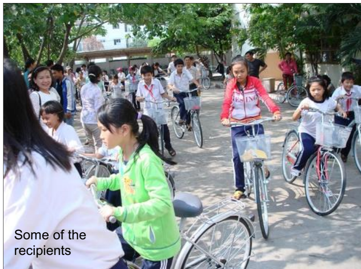
Some of the recipients

Your simple but indispensable gift for these children means that they are given the gift to be able to ride to school; they now have independence and are freed from the enormous inconveniences in having to walk to and from school in the morning, for lunch and at the end of the school day.