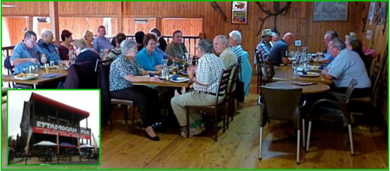
SVVA Qld enjoying a meal and friendship at the Ettamogah Pub on the Sunshine Coast in early June