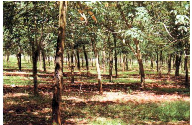
The Reunion Group gathered at the Long Tan Cross for the Remembrance Service and at right the rubber plantation where the battle occurred.

now being a big industrial park. However, we did pay a visit to the museum that holds the original Long Tan Cross. Our guide gave us a great insight into Vietnamese history and culture. Coming back after all this time and being able to re-engage with the people without fear or suspicion was just wonderful and to see them so happy and industrious made the visit quite special.